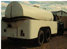
Regular Pumping extends the life of your system.

When the solid waste in the tank builds up to more than half the capacity of the tank, it is time to have the tank pumped out and serviced. For a typical septic system this should be done once every three to five years depending on system and water usage.